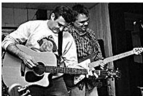
Susquehanna River Band Published: June 1998, Fly Magazine